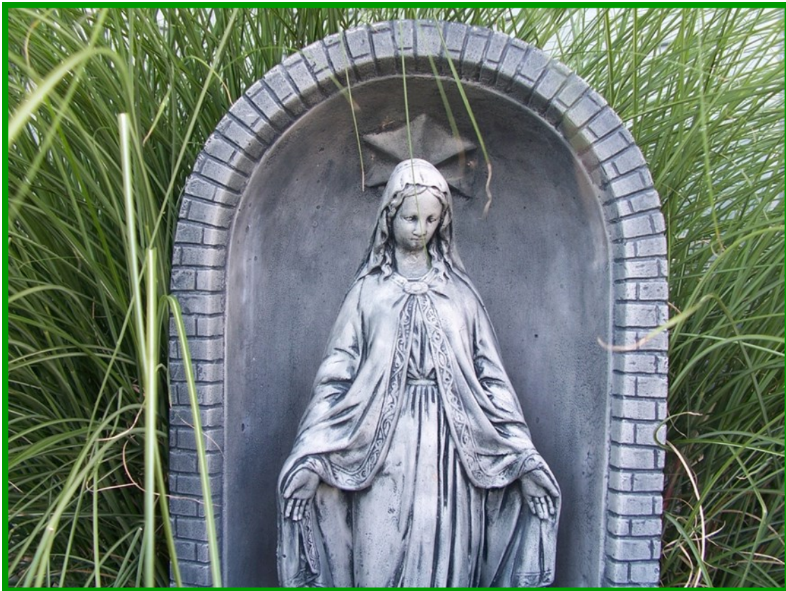
Our Lady Star of the Sea